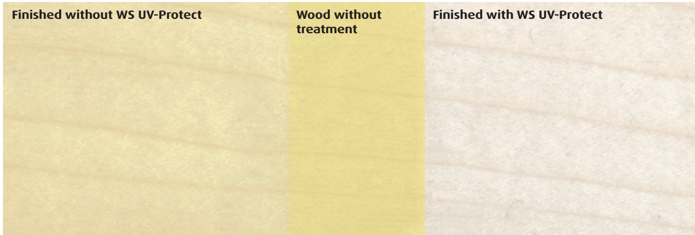
Finished with WS UV-Protect